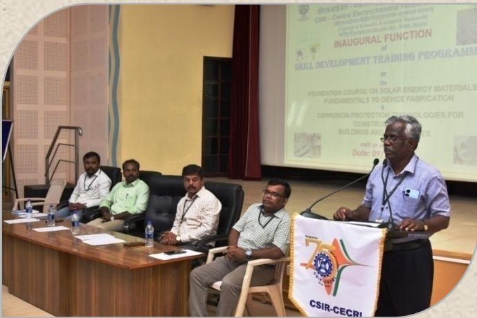
Skill Development Training Programmes organized by CSIR-CECRI