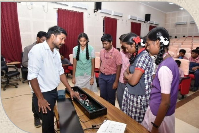
Training on Assembly of World Climate Clock and Handing over of 2 WCC units to KV, Karaikudi and GHSS, Ariyakudi