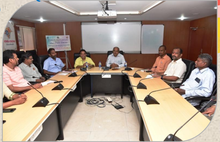
Training Programme on Roster and Reservation Management