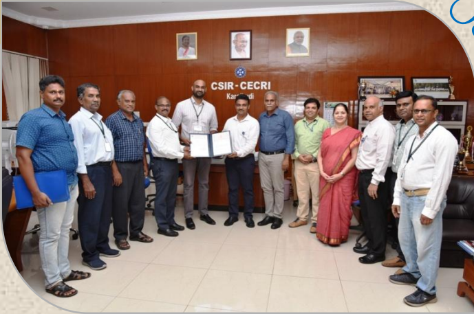
Knowhow Transfer to M/s. IEC Fabchem Limited, Chennai