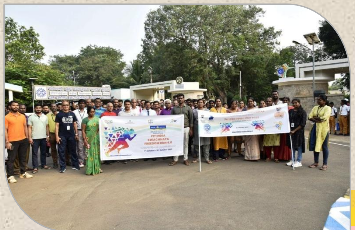
Fit India Freedom Run 4.0