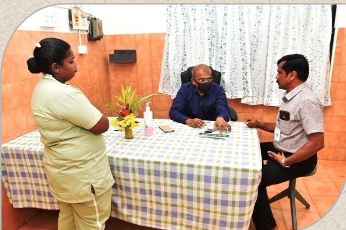
Urology Medical Camp