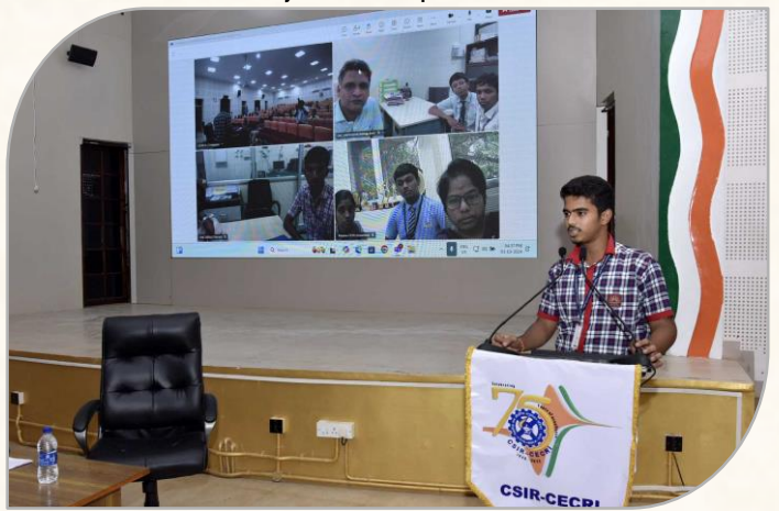
One Day Scientist Programme for School Students