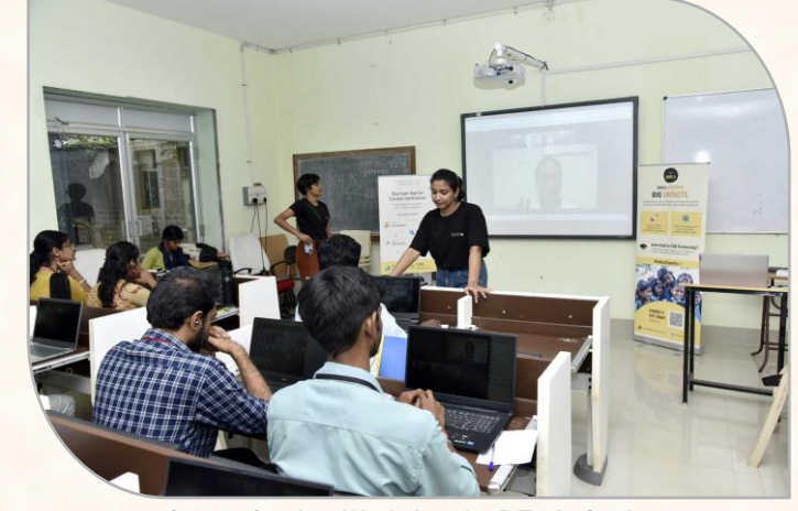
Career Catalyst Workshop for B.Tech. Students