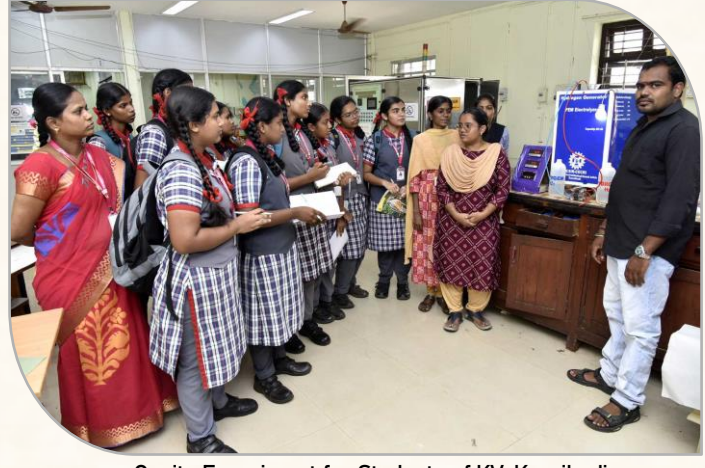
Onsite Experiment for Students of KV, Karaikudi