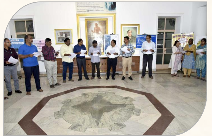
Vigilance Awareness Pledge