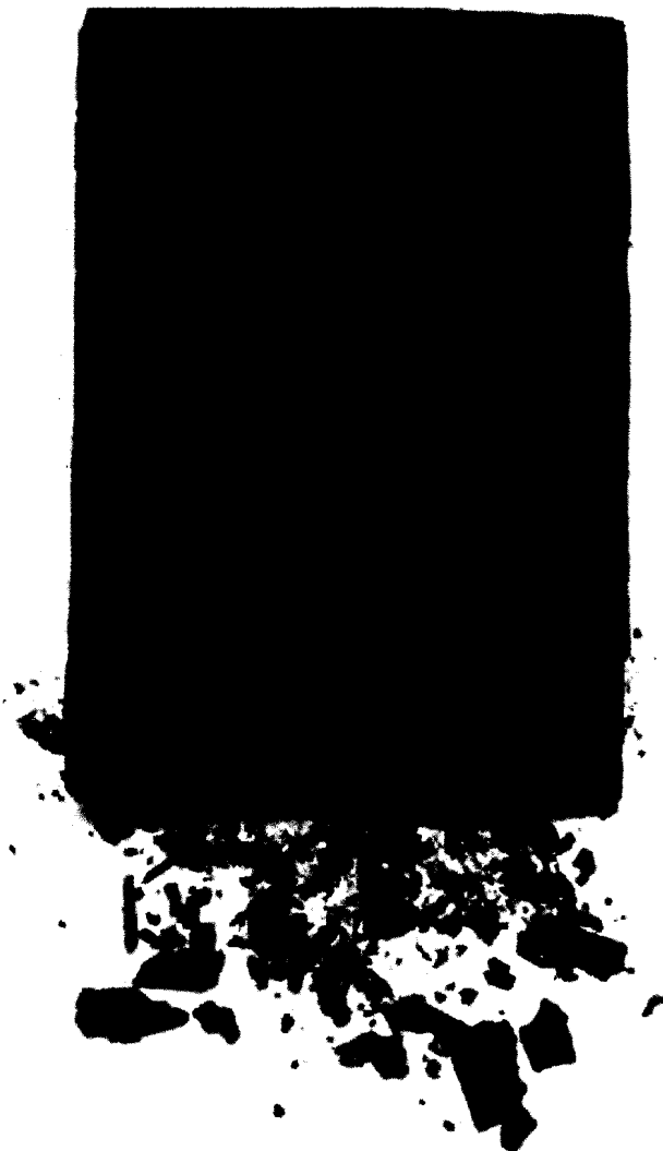
Mild steel panel exposed at Chennai Naval Base over a period of eight months.